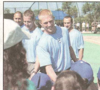
Athletes from the University of San Diego baseball team greet players.