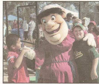
The San Diego Padres Friar clowns around with some of the junior athletes during the Miracle League opening day ceremonies.