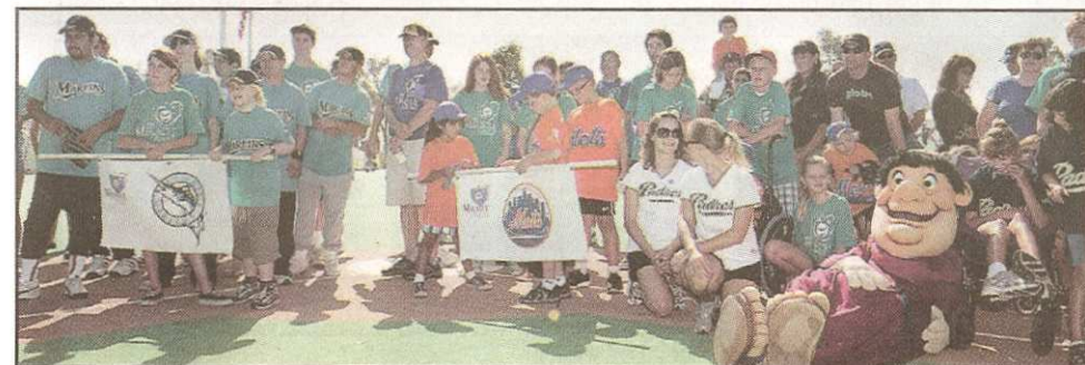
The San Diego Padres Friar hangs out with participants.